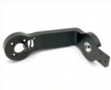
Aluminum 6061 part Surface with anodize black color