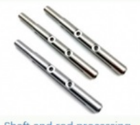
Shaft and rod processing