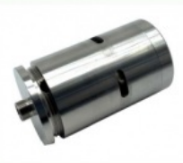
304 stainless steel Lathe machining turning part