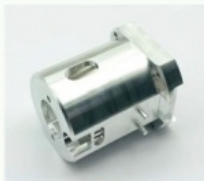
Aluminum 7075 part Surface with original color-5 axis CNC machining center