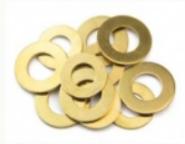
CNC laser cutting shims for sealing and fasteners Smallest thickness 0.01mm