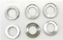
Kovar alloy(4J29) washer For medical device use