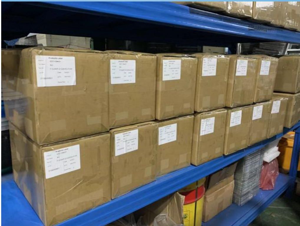
PE bag and foam, outside with carton