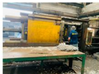
1000 ton die-casting machine