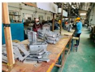
post procesing workshop