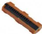
Piston- 14T all half tooth