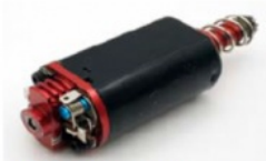
AEG Motor-high torque long type