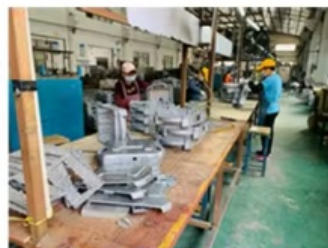
post procesing workshop