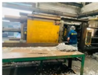
1000 ton die-casting machine