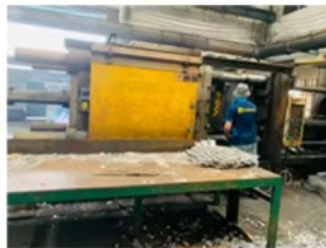
1000 ton die-casting machine