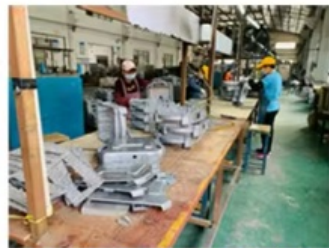
post procesing workshop