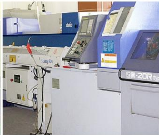
Automatic lathe core moving machine