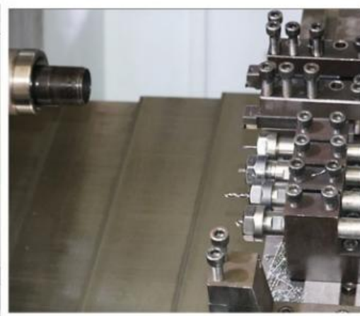
Drilling and tapping machine

Dongguan Minda Metal Tchechnology Co.,Ltd. Was founded in 2015. We specialize in producing MIM parts, PM part, CNC machining parts and Aluminum alloy, Magnesium alloy and Zinc alloy die casting parts. At the same time we also undertake the corresponding product mold design and development and production.