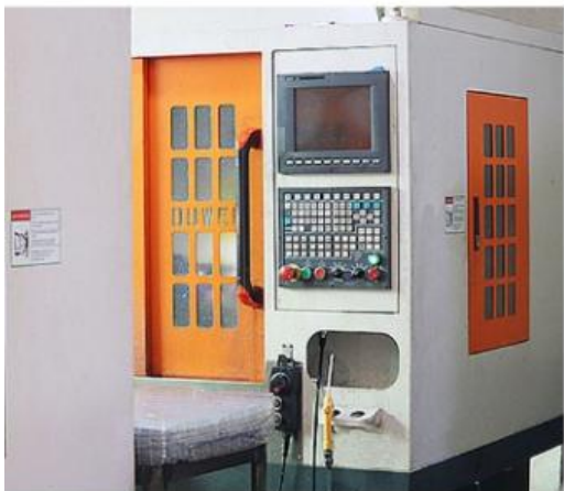
CNC engraving machine