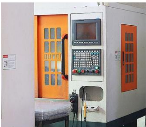
CNC engraving machine