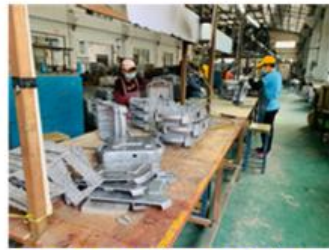
post procesing workshop