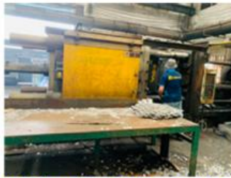
1000 ton die-casting machine