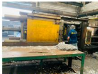
1000 ton die-casting machine