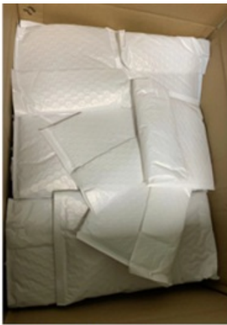
Packed in foam envelope Protect the products from scratch and rust