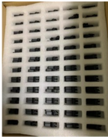
Packed in foam blister Protect the products from Damage and rust