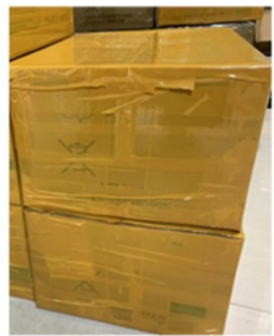
Outer package, with carton boxes with 0.6mm thick to keep the parts safe and complete to arrive at the destination