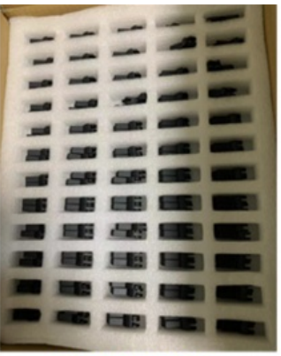
Protect the products from Damage and rust