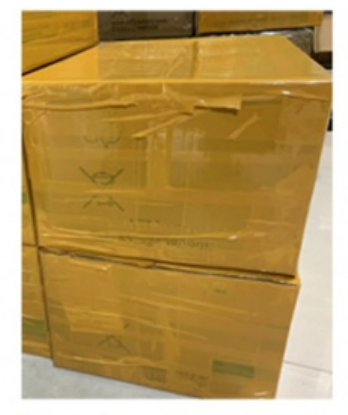
Outer package, with carton boxes with 0.6mm thick to keep the parts safe and complete to arrive at the destination