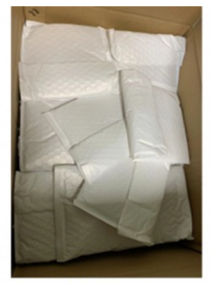
Packed in foam envelope Protect the products from scratch and rust