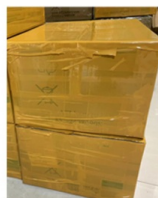
Outer package, with carton boxes with 0.6mm thick to keep the parts safe and complete to arrive at the destination