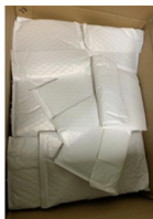
Packed in foam envelope Protect the products from scratch and rust