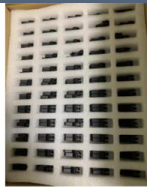
Packed in foam blaster Protect the products from Damage and rust