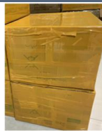
Outer package, with carton boxes with 0.6mm thick to keep the parts safe and complete to arrive at the destination