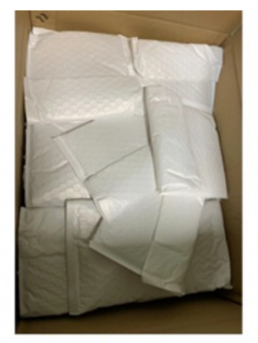
Packed in foam envelope Protect the products from scratch and rust