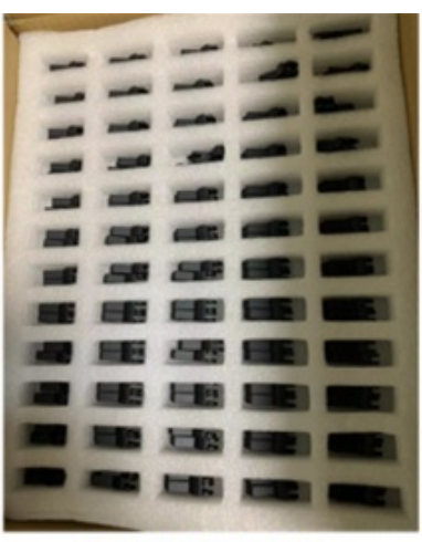
Packed in foam blister Protect the products from Damage and rust