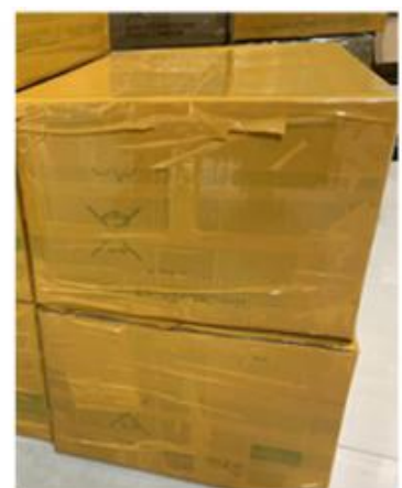
Outer package, with carton boxes with 0.6mm thick to keep the parts safe and complete to arrive at the destination