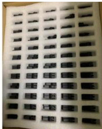
Packed in foam blister Protect the products from Damage and rust