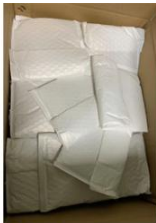
Packed in foam envelope Protect the products from scratch and rust