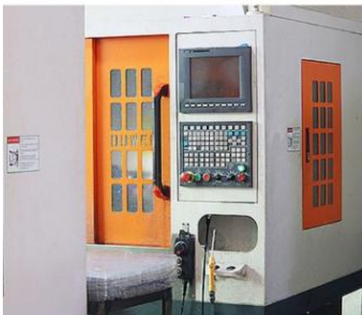
CNC engraving machine