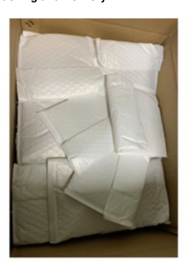
Packed in foam envelope Protect the products from scratch and rust