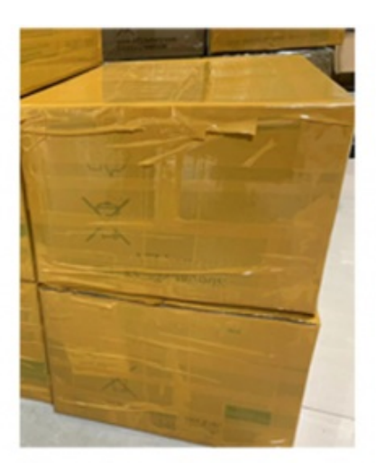
Outer package, with carton boxes with 0.6mm thick to keep the parts safe and complete to arrive at the destination