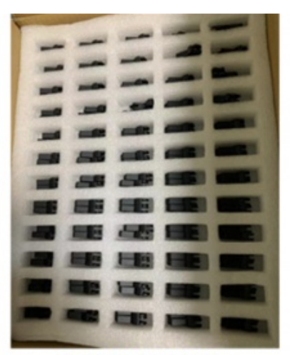
Packed in foam blister Protect the products from Damage and rust