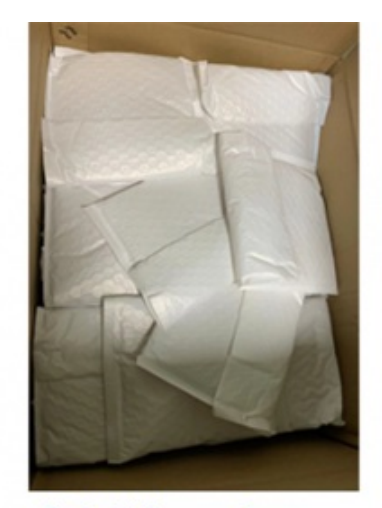
Packed in foam envelope Protect the products from scratch and rust