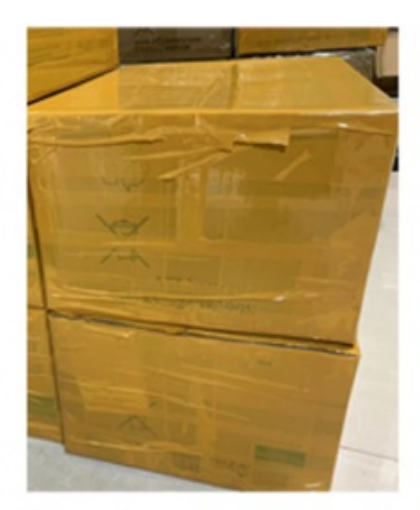
Outer package, with carton boxes with 0.6mm thick to keep the parts safe and complete to arrive at the destination