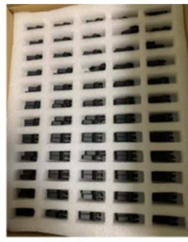
Packed in foam blister Protect the products from Damage and rust