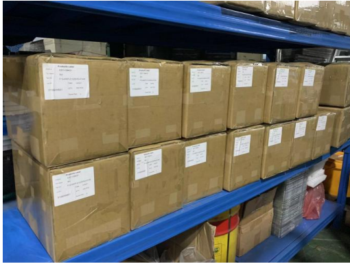
PE bag and foam, outside with carton