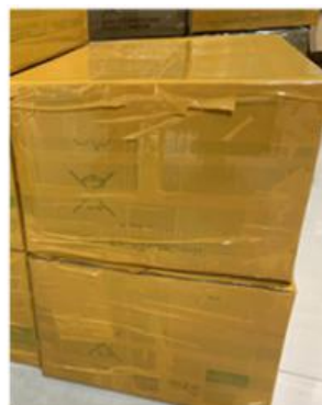
Outer package, with carton boxes with 0.6mm thick to keep the parts safe and complete to arrive at the destination