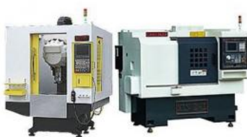
CNC engraving machine/CNC lathe

8 pcs four axis and five axis CNC finishing machines, 20 precision CNC lathes, specializing in the processing of precision hardware parts of the turning, cutting, milling, drilling and so on.