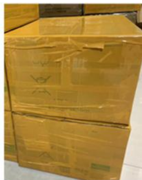
Outer package, with carton boxes with 0.6mm thick to keep the parts safe and complete to arrive at the destination