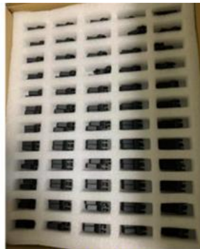
Packed in foam blister Protect the products from Damage and rust