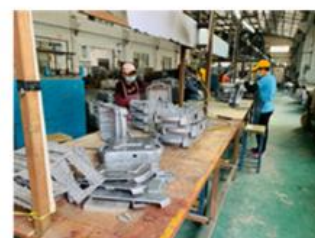
post procesing workshop

Custom MIM Parts with various kinds of shape